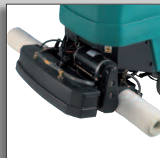
1610 - Rollers for maintenance cleaning