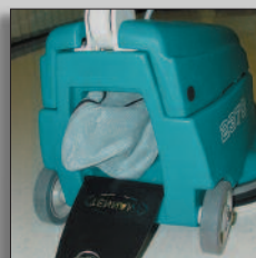
Disposable paper bag