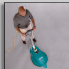
Machine in action