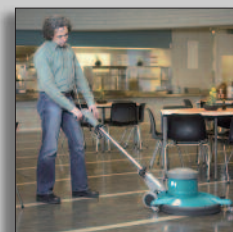
Machine in action